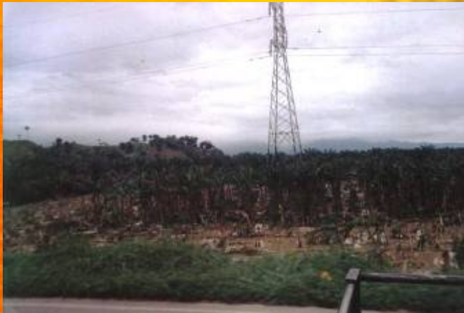
Crops completely washed away!