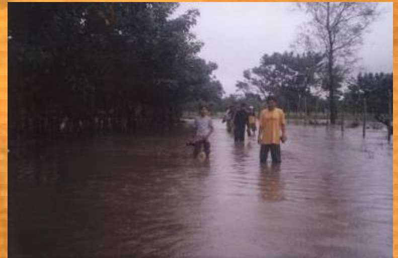
Chuical youth going to help those in need!